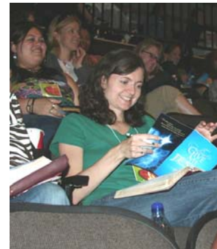
Some of our treasured ladies